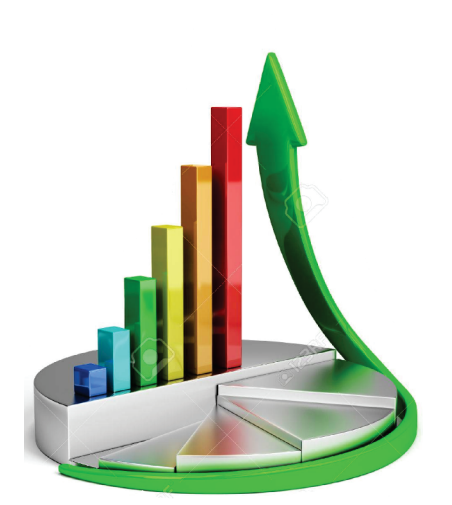
Consolidating Sustainable Growth

No wonder at the 54th Annual Bankers' Dinner, the Governor announced the formation of another initiative of the Bankers' Committee, the establishment of Bankers Charitable Endowment Fund, instituted to fund strategic charitable initiatives in States and Local government areas in the country every year.